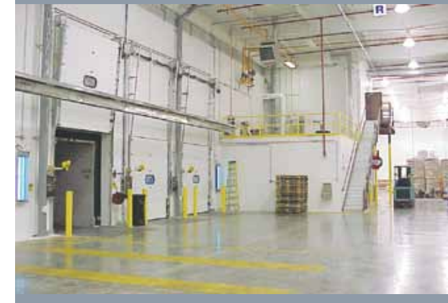
Nestlé, Eau Claire, WI • Shipping/Receiving