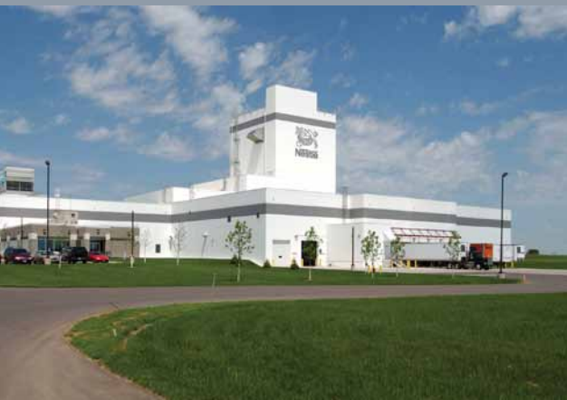
Nestlé, Eau Claire, WI