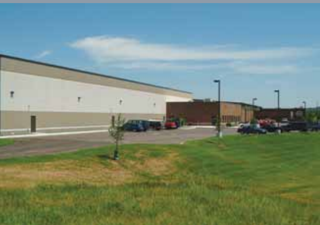
Silver Spring Gardens, Eau Claire, WI