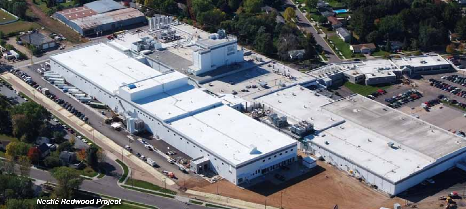
Nestlé Redwood Project