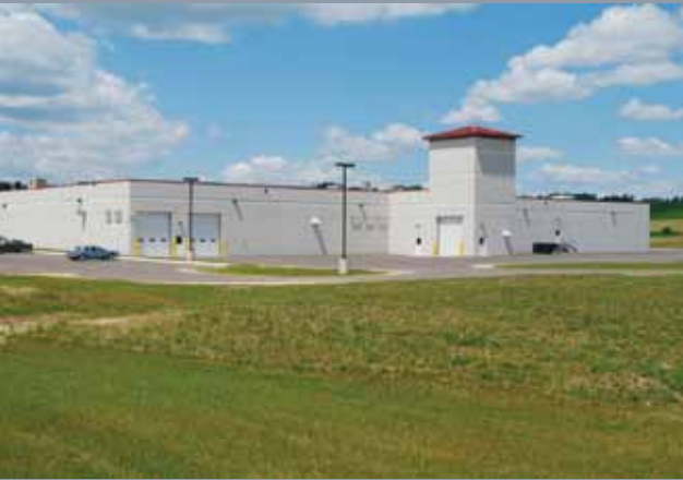
Gold'n Plump, Independence, WI