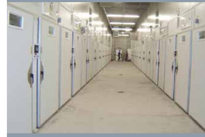
Gold'n Plump, Independence, WI • Hatchery