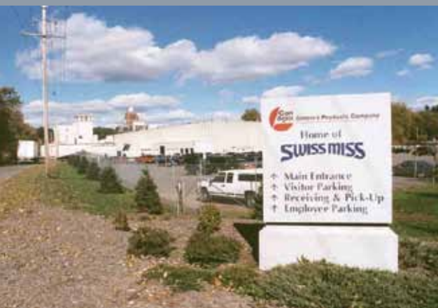
ConAgra Foods, Menomonie, WI