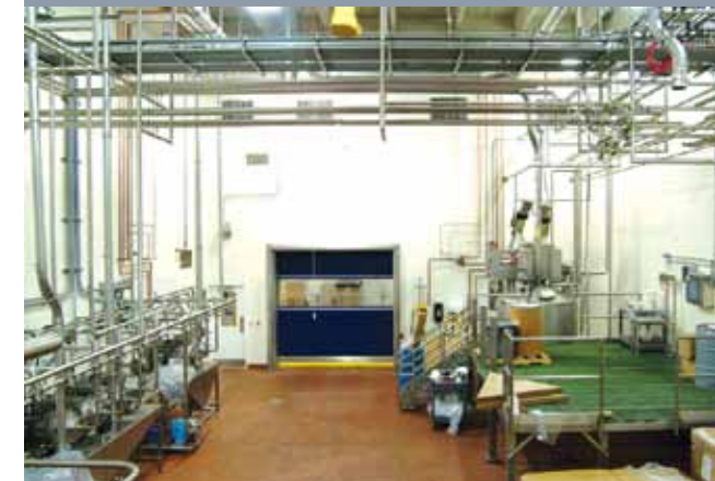
Silver Spring Gardens, Eau Claire, WI • Processing