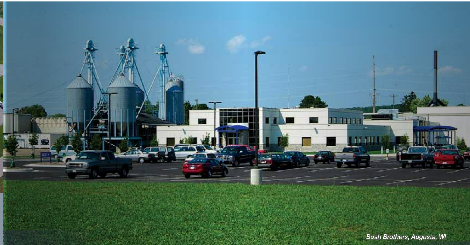
Bush Brothers, Augusta, WI