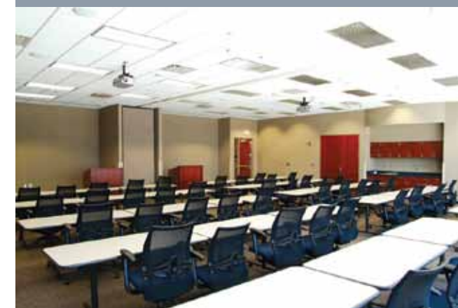
Bush Brothers, Augusta, WI • Conference Room