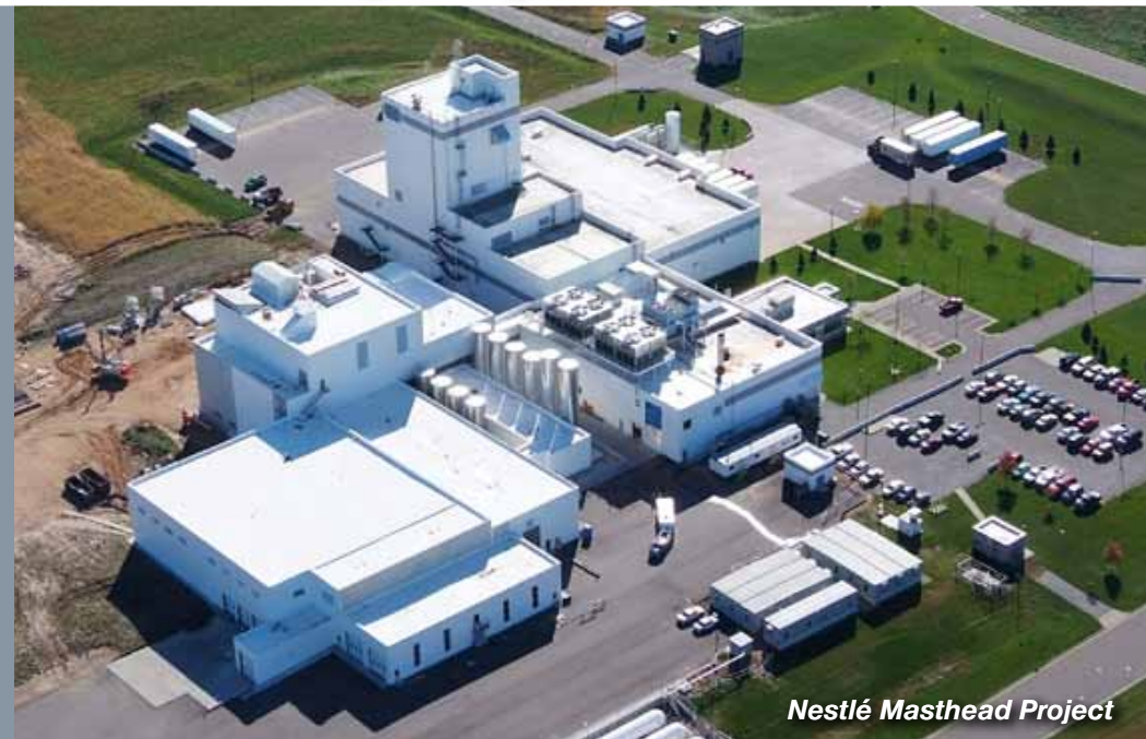
Nestlé Masthead Project

The Nestlé Masthead Project is a 138,000 square foot processing addition that features 80 foot tall cast in place concrete walls. The entire project was done in 3D Modeling for preconstruction and hygiene details.